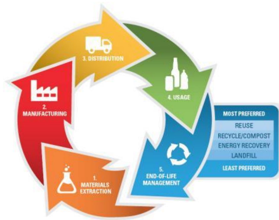
Figure 3. A Sustainable Materials Management Cycle

Sustainable materials management is another approach which emphasizes the need to reduce global consumption of resources (EPA 2017). Sustainable materials management includes source reduction or prevention and tends to be focused toward environmental outcomes, as compared to the economic focus of the circular economy approach. An example of a sustainable materials management approach can be found in Figure 3.